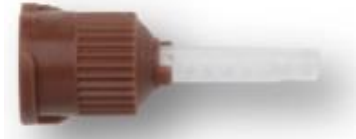
15 Mixing Tips