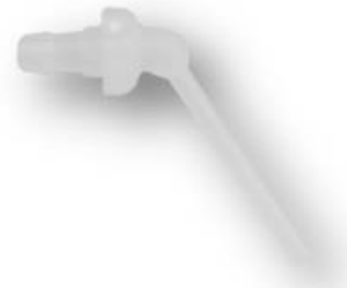
15 Angled Tips