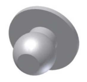
cast-to noprax (for use with any dental alloy) 1.7 & 2.2mm