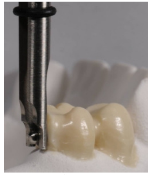
Cast-to The undercut behind the metal proximal plate is fully incorporated into the wax-up

The male should be placed as close as possible to the tissue to reduce abutment stress, increase inteocclusal space, eliminate food traps, and allow for good esthetics and hygiene.