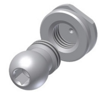
threaded male and IR/NP base ring (2.2mm size only)