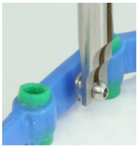
Threaded The sphere is threaded into the base ring, then paralleled and set into the wax-up.