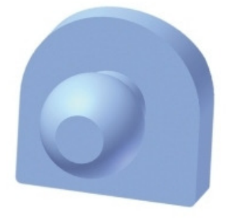
plastic castable pattern 1.7 & 2.2mm