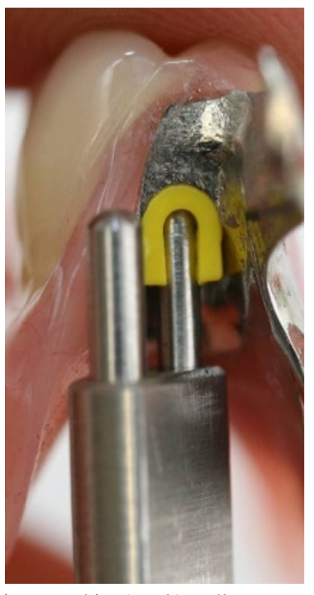
After processing, use the Sagix insertion tool to place the appropriate female insert--white (weak), yellow (standard), or red (strong) retention.

The Preci-Sagix is ideal as an extracoronal attachment on extracoronal partial dentures as well as distal, lingual, or buccal placement on overdenture bar cases.